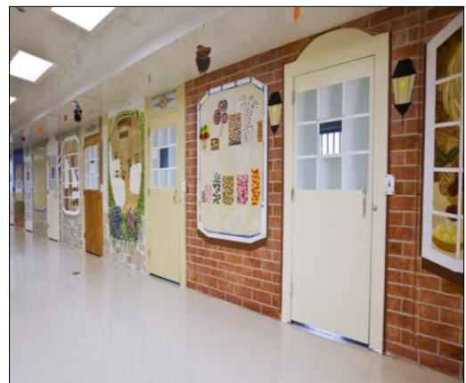
A housing unit at the Elliot Leahy Center in Worcester, MA.